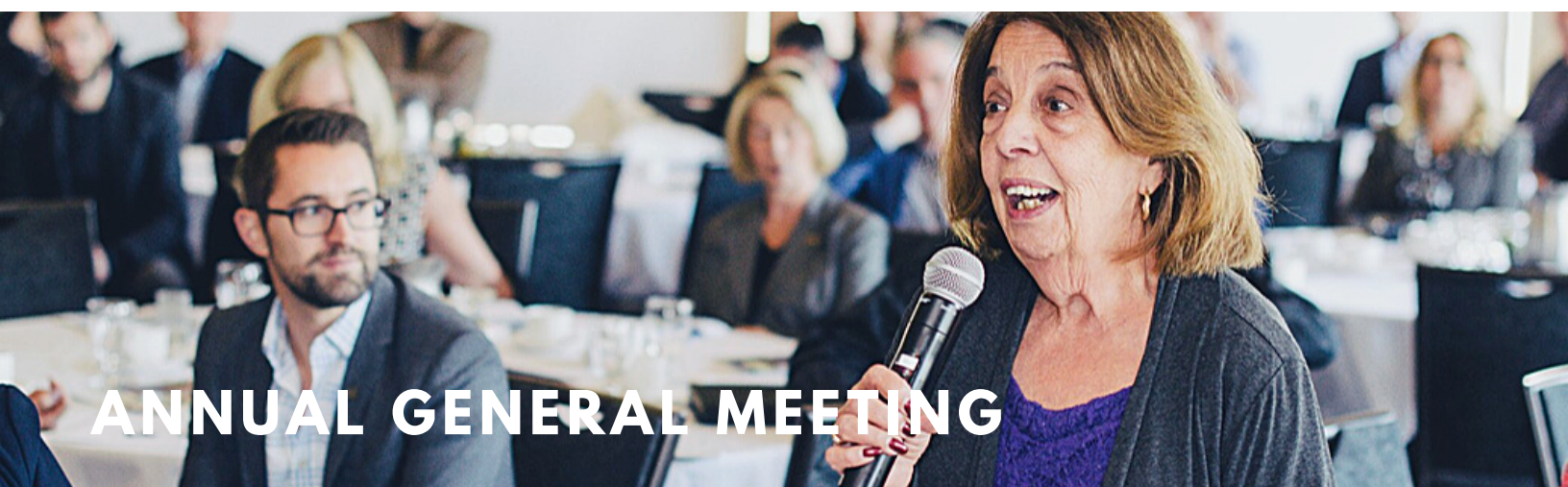
ANNUAL GENERAL MEETING