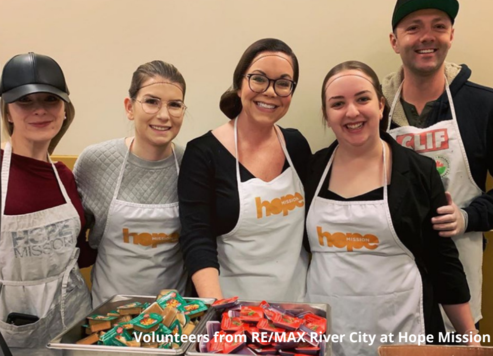
Volunteers from RE/MAX River City at Hope Mission