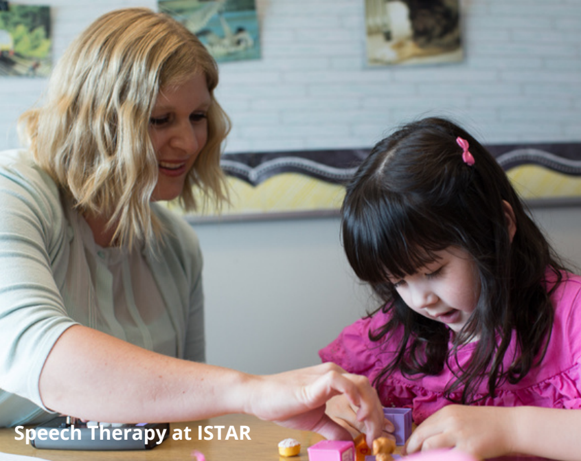
Speech Therapy at ISTAR