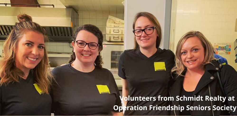
Volunteers from Schmidt Realty at Operation Friendship Seniors Society