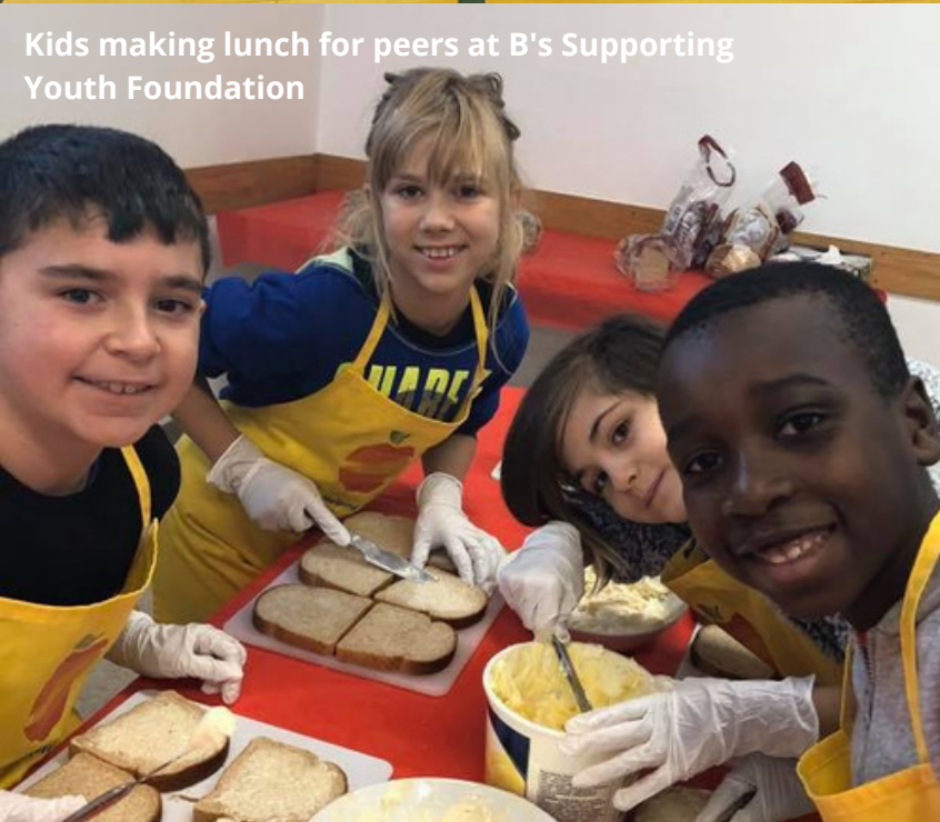
Kids making lunch for peers at B's Supporting Youth Foundation