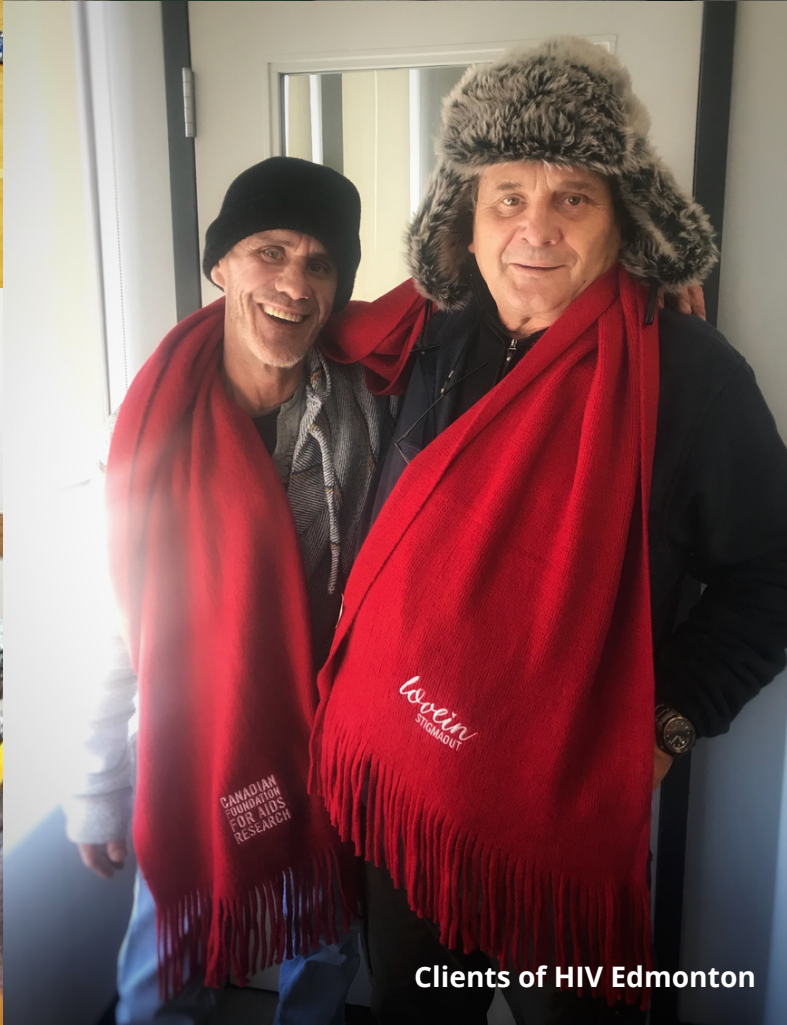
Clients of HIV Edmonton