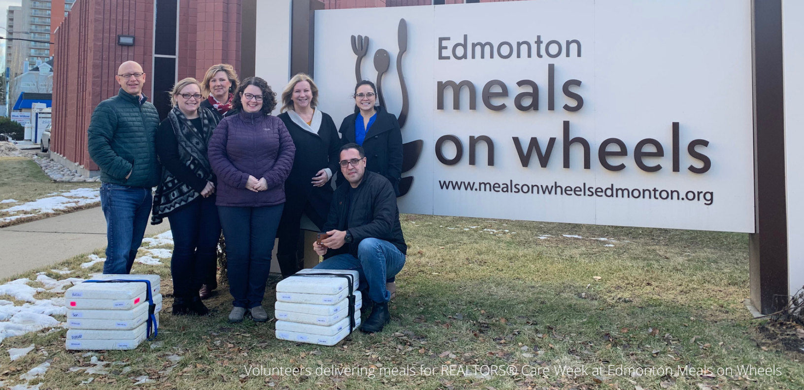
Volunteers delivering meals for REALTORS® Care Week at Edmonton Meals on Wheels