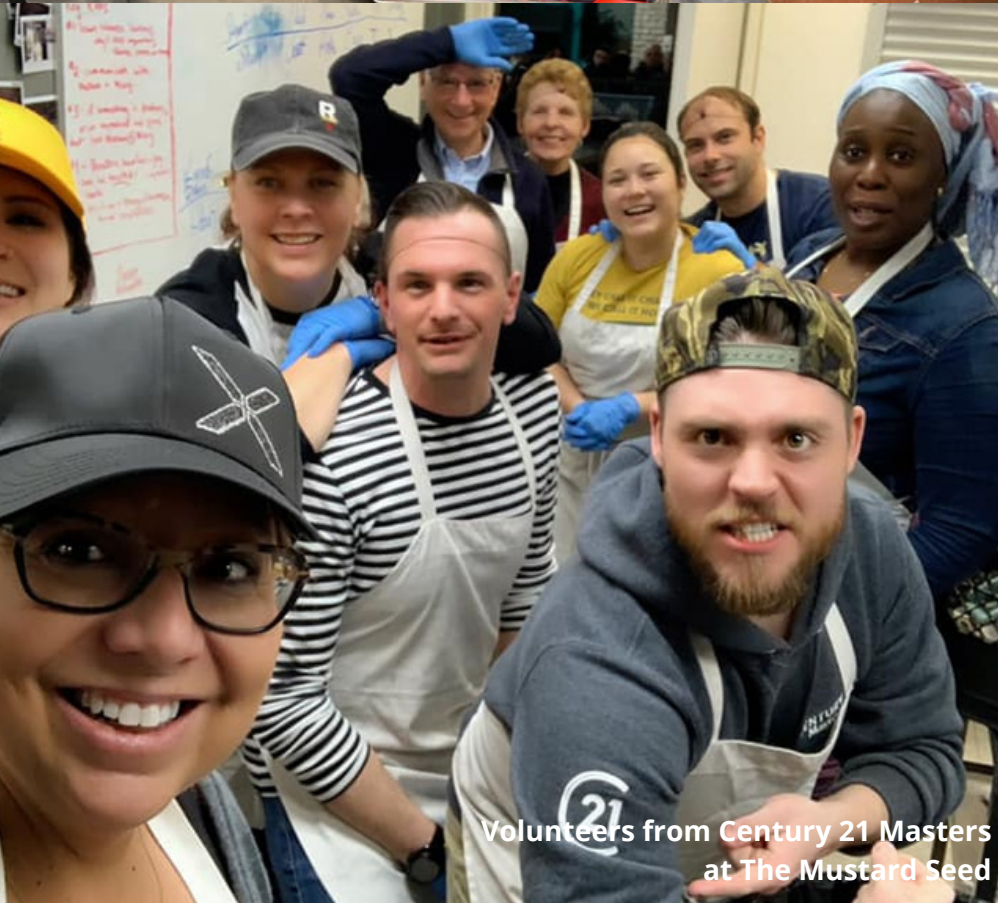
Volunteers from Century 21 Masters at The Mustard Seed