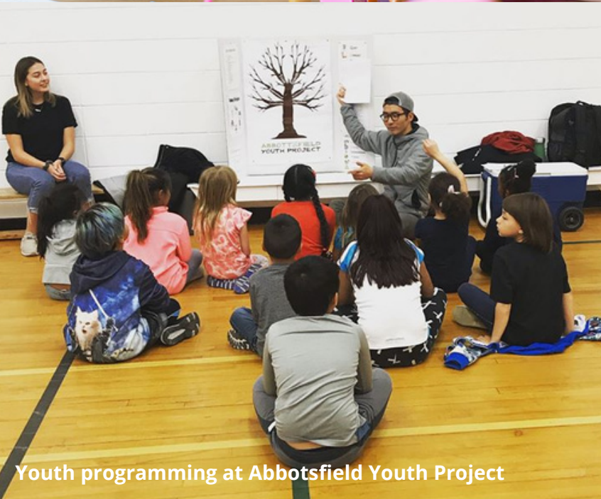
Youth programming at Abbotsfield Youth Project