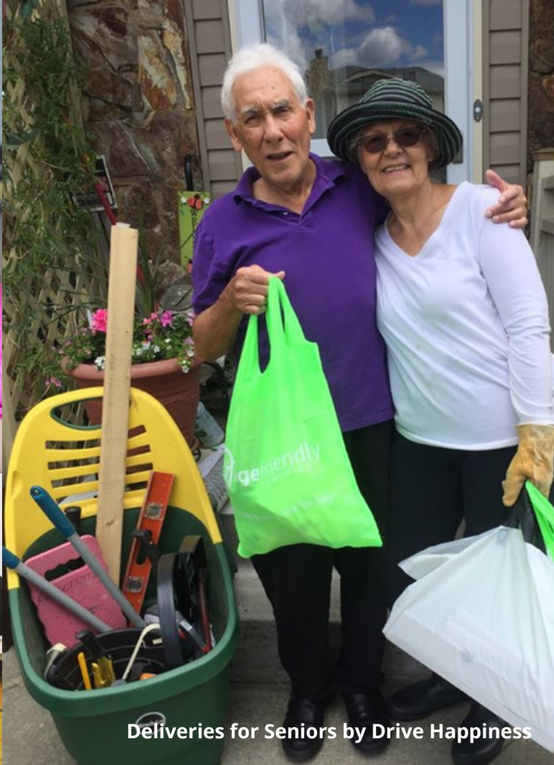
Deliveries for Seniors by Drive Happiness